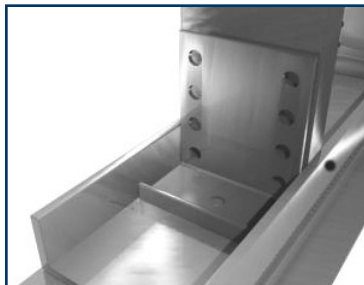
Place StiffClip CL at bottom of stud.