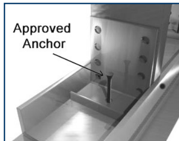
Attach clip to deck with approved anchor.