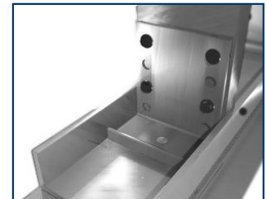
Secure clip to stud with required amount of symmetrically placed #12 screw fasteners.